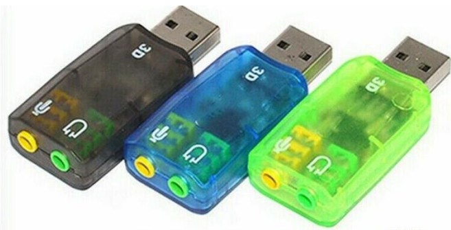
Cheap USB sound dongles.